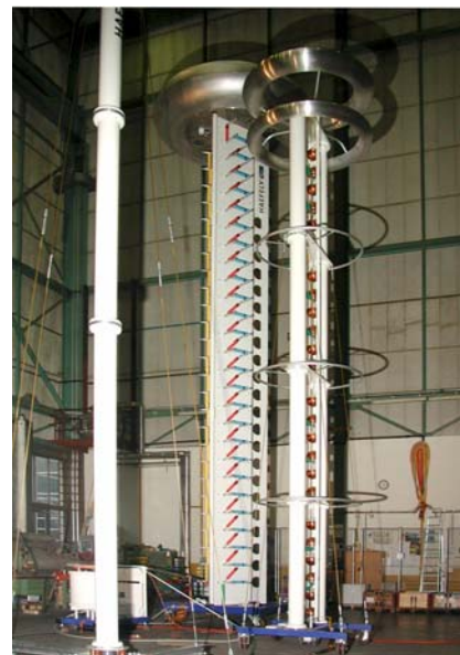
Multiple chopping gap MAFS in front of an SGDA

The H base frame of welded steel profiles is equipped with four swivel castors.