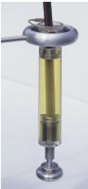
Fig. 3 Cable test termination KEV 50. 50 kV AC